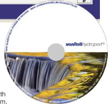
The latest CD-ROM with free application program.